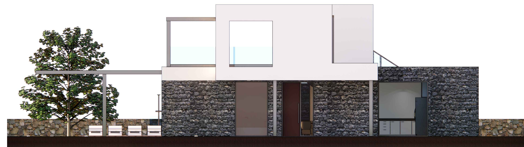
ALZADO LATERAL DERECHO